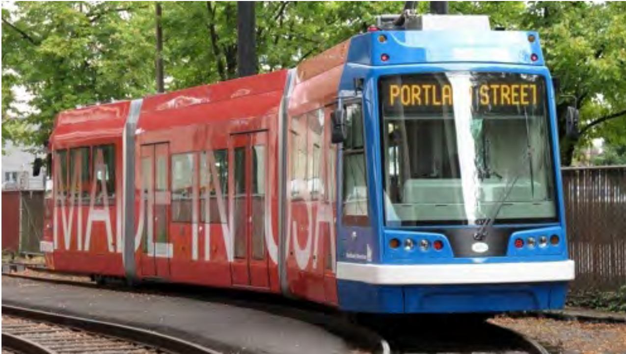
In Portland, United Streetcar's new vehicles will support an extension of the Portland Streetcar network.

drive to support American-made products. In today's global economy – and with the attraction to goods made cheaply overseas – much of that has disappeared. But businesses can lead the effort to keep the American-made label alive, keep it competitive and keep it strong.