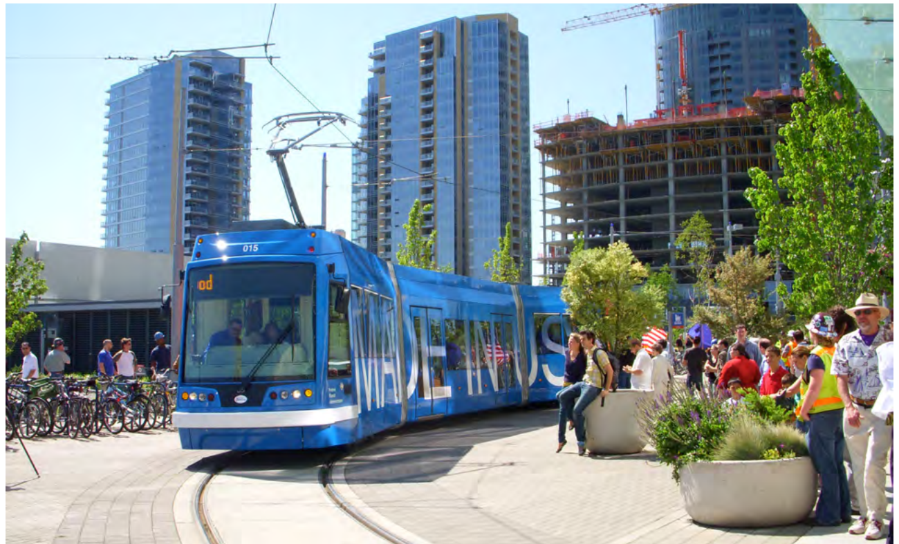
United Streetcar's first finished vehicle debuts in Portland, Ore.

Our success is not just our own. We have revitalized the streetcar manufacturing sector, delivering new work to more than 200 vendors and their employees across 20 states. These businesses now know that they can market and sell their components for a new application, an opportunity that every company hopes for as it works to grow its bottom line. Our subcontractors and vendors are key partners in our quest to revitalize the streetcar industry in the United